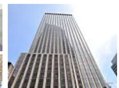
Charles Schwab Moving to 1133 Avenue of