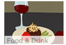
Food & Drink

FEATURED: ICSC 2014, POWER 100, MO'S TOP 50 LIST, OWNERS MAGAZINE