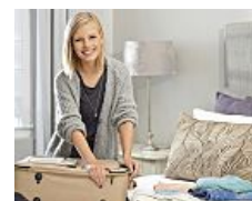
Pack Like a Pro: 8 Tips from a Travel-Savvy