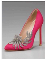
PINK MANOLO BLAHNIKS